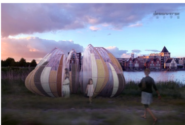
Follow the scents 循味之旅 | 小葱...